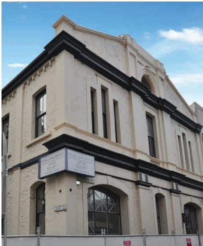
Light Square, Adelaide - not listed

The existing listing criteria and processes are cutting edge and have been widely adopted around Australia over the past 30 years. The only problem at the moment is the Minister’s refusal (contrary to the legislative framework) to approve new local heritage listing proposals from local councils.